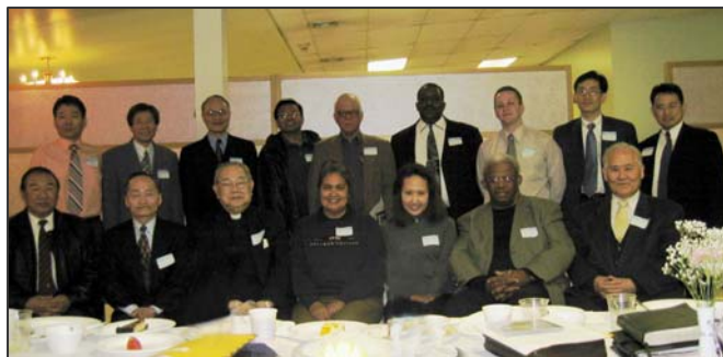
Photo of last year's planning committee (2004) with representatives from the various churches

Joining us this year for the afternoon of praise will be six other ethnic congregations: First Filipino Baptist Church, Vietnamese Alliance Church, Grace Trinity NNN-Multi Cultural Ethnic India Church, Cambodian Church, Saints Tabernacle Community Church and Japanese Proclamation Church.